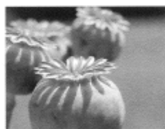
poppy seed capsules