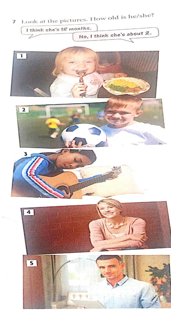
Unit 2 · Your world