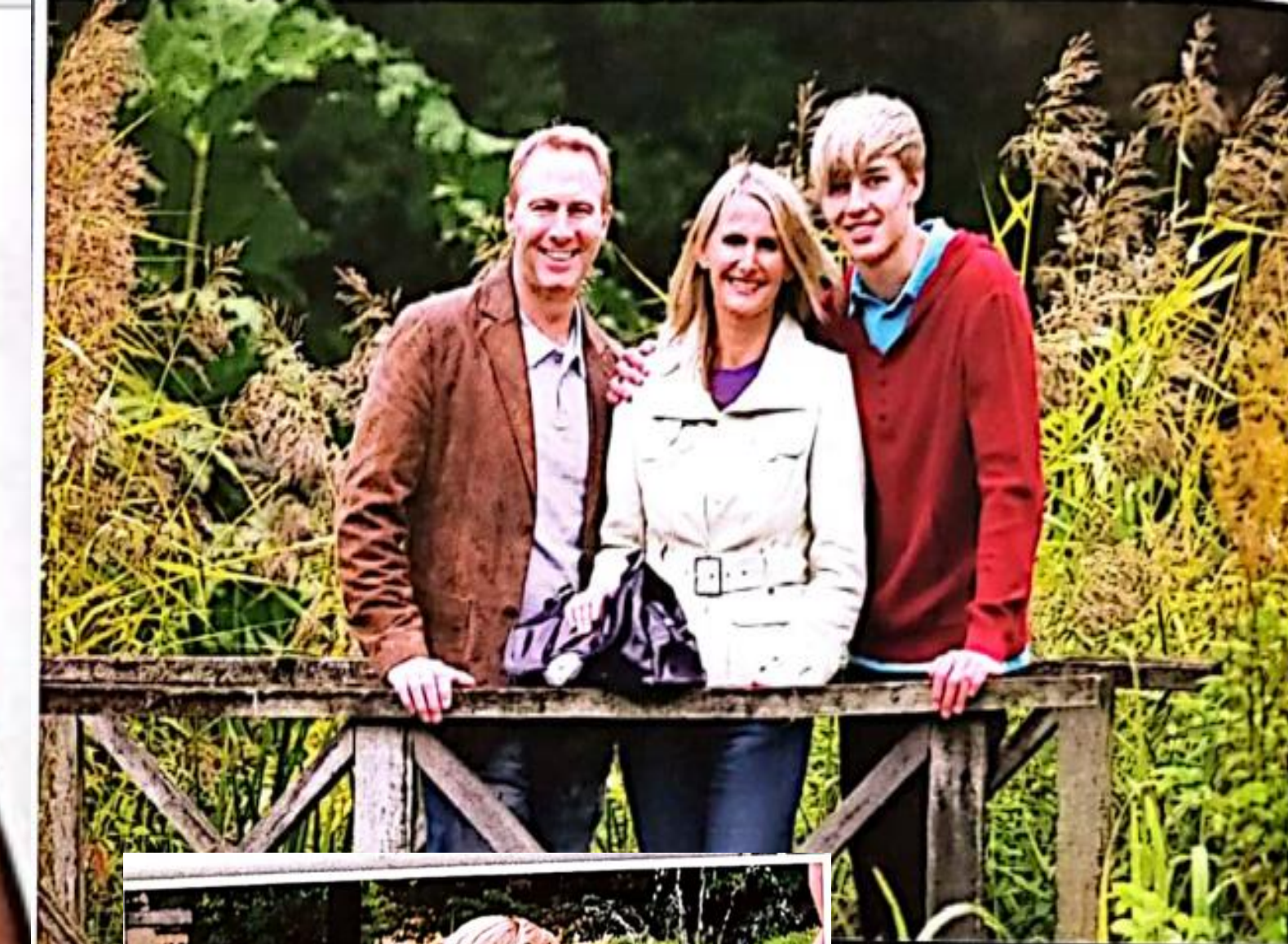
Me with Mom and Dad